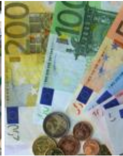
Economy regis increase of €0.