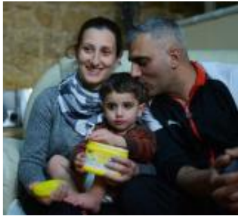
Watch: Two-year-old boy loses his