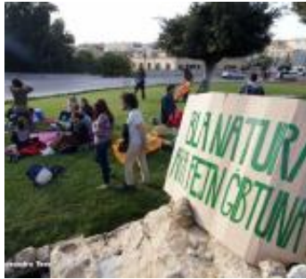
Updated (2): 'Roundabout